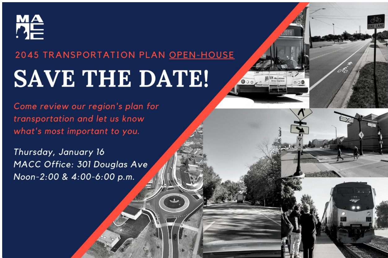
Figure 40: One of the graphics used to promote the 2045 LRTP open house