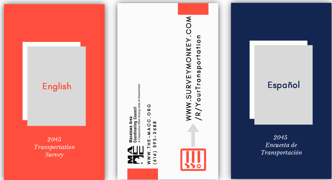
Figure 37: Images of what the English and Spanish 2045 LRTP survey cards looked like

During the development of the LRTP, public surveys were developed in English and Spanish and were made available online or hard-copy at request. Notice of the survey was distributed throughout the community not only by the MACC but by local units of government and community organizations. Examples of survey outreach can be found in the appendix.