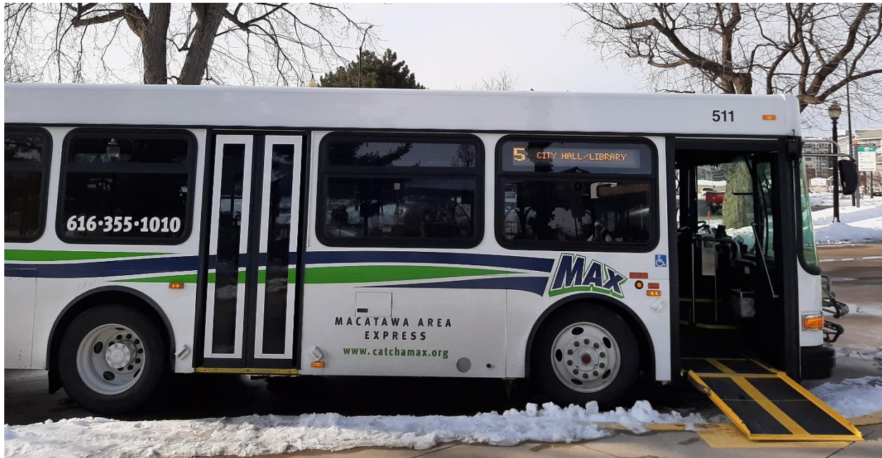
Figure 39: Photo of a MAX Transit bus taken on January 22, 2020, after riding route 5

snowfall can make accessing some stops difficult for pedestrians and that drivers typically stop at the next closest snow-free driveway to let passengers off. Many of the riders spoke to MACC staff about their typical commutes and where they would like to see stops added or changed in the future. Comments throughout the day indicated that riders are very thankful to have access to the bus and that it is their main mode of transportation to places like work, appointments, and shopping. For more on ridership satisfaction and trip information, MAX Transit produced a survey in August of 2019, this can be found in the appendix.