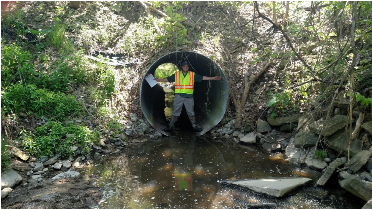
Figure 20: Inventory of a culvert during one of the MACC's volunteer road-stream crossing events

Corps. The program seeks to inventory all of the road-stream crossing locations throughout the watershed in Allegan and Ottawa counties to quantify sediment pollutant loads, identify barriers to fish passage, and prioritize remediation or replacement of problematic crossings. The program has the potential to identify problematic crossing locations early and therefore possibly prevent structure failure during large storm events. From 2016 to 2019, trained leaders and volunteers completed inventories of 159 crossings, about 25% of the total.