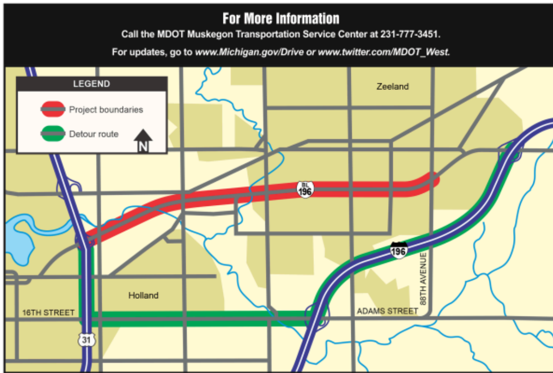
Prepared by: GRAPHICS/OFFICES/COMMUNICATIONS/Files-Postcards/2023/I-196 BL Holland (12/23 CJ)

Work begins in April and is expected to be finished in late November 2024.