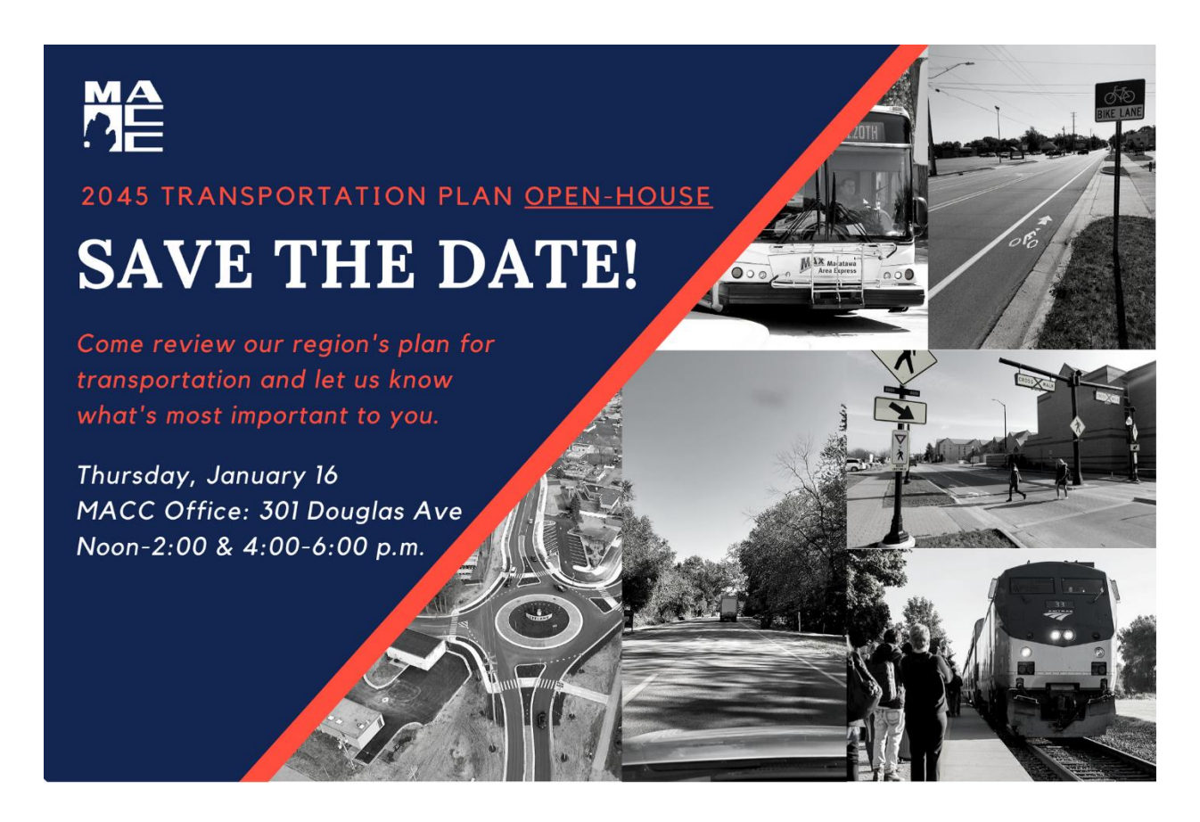
Figure 40: One of the graphics used to promote the 2045 LRTP open house