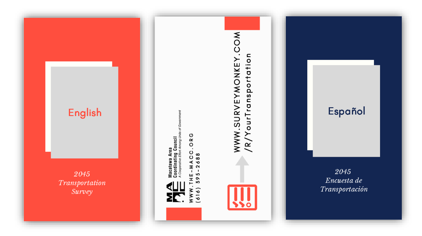
Figure 37: Images of what the English and Spanish 2045 LRTP survey cards looked like

During the development of the LRTP, public surveys were developed in English and Spanish and were made available online or hard-copy at request. Notice of the survey was distributed throughout the community not only by the MACC but by local units of government and community organizations. Examples of survey outreach can be found in the appendix.