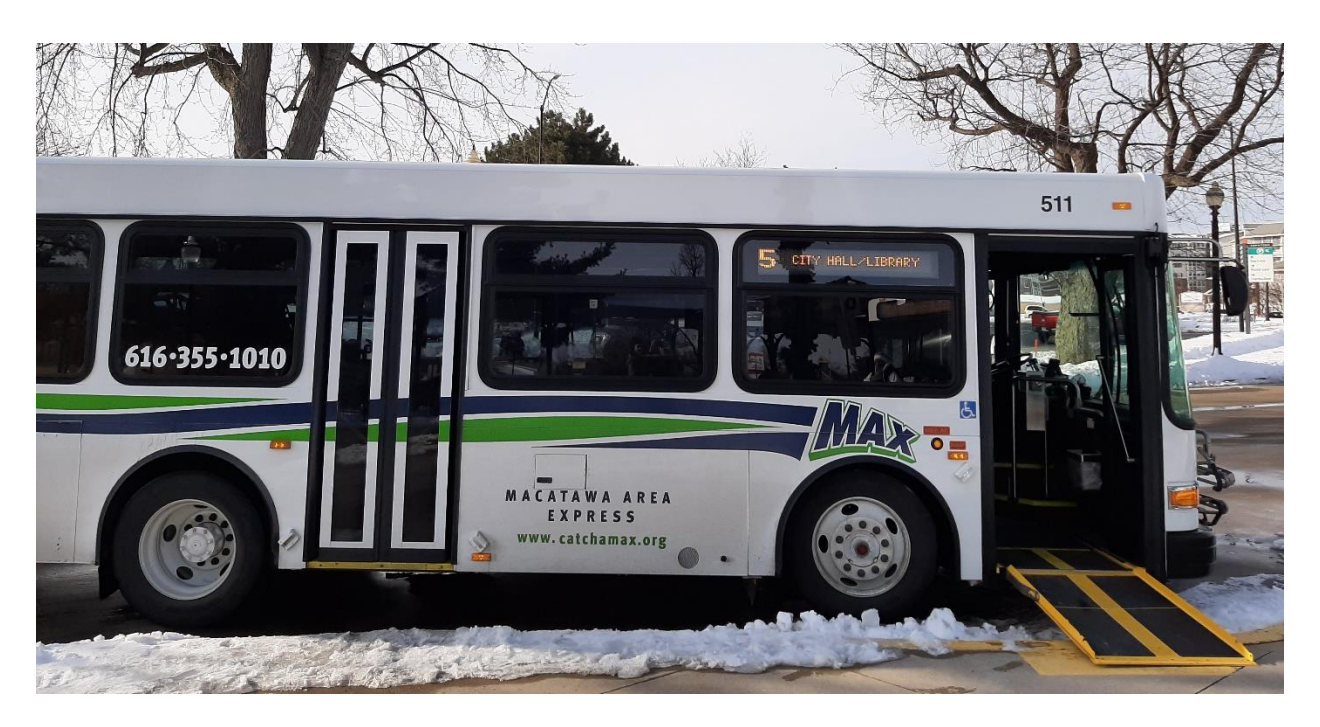
Figure 39: Photo of a MAX Transit bus taken on January 22, 2020, after riding route 5

snowfall can make accessing some stops difficult for pedestrians and that drivers typically stop at the next closest snow-free driveway to let passengers off. Many of the riders spoke to MACC staff about their typical commutes and where they would like to see stops added or changed in the future. Comments throughout the day indicated that riders are very thankful to have access to the bus and that it is their main mode of transportation to places like work, appointments, and shopping. For more on ridership satisfaction and trip information, MAX Transit produced a survey in August of 2019, this can be found in the appendix.